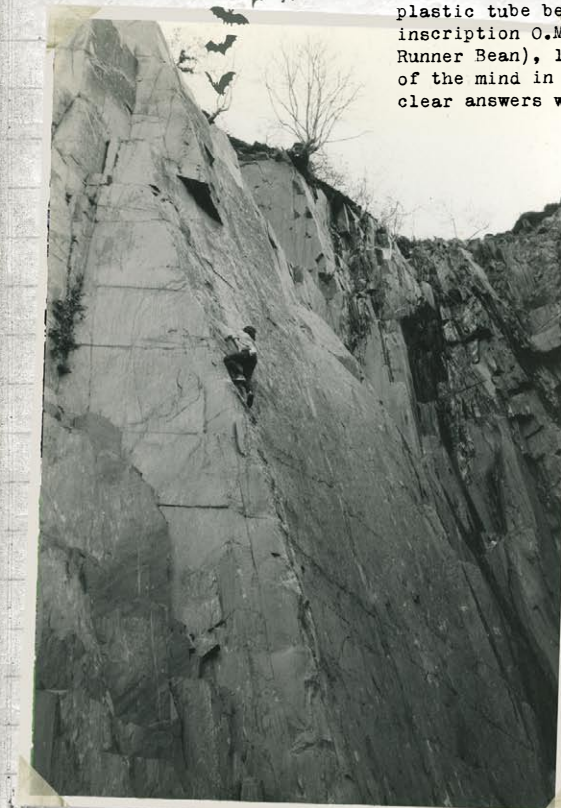
Martin Crook, a ropeless acolyte scaling the gothic rampart of Horse Latitudes